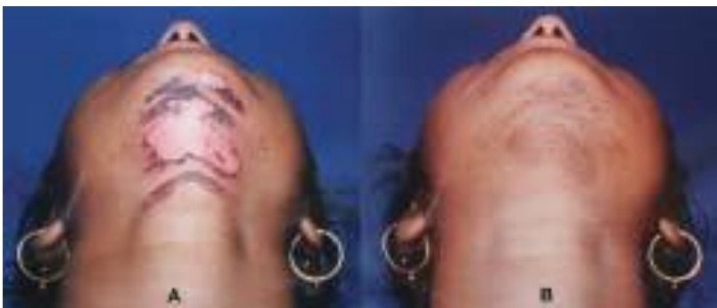
Figure 17: Burns after 2nd HR treatment by IPL even with 755 filter in a dark skin type. Photograph on 3rd day. Two months later hyper pigmentation still persists. Three very superficial burn marks after 1st treatment with the same filter were neglected and fluence jumped by just 2 J/cm 2 .

Fractional Laser Resurfacing delivers light in an array of high precision micro beams. These micro beams create narrow, deep columns of tissue coagulation that penetrate well below the epidermis and into the dermis, while sparing the tissue surrounding the columns from damage. The coagulated tissue within the columns