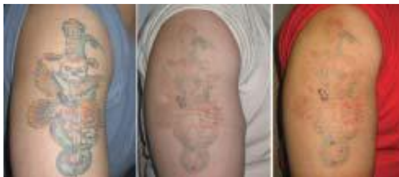
Figure 12: Multicolored tattoo treated with 4 simultaneous treatments with Q-Switched 1064 nm (for black and green) and 532 nm (for red). Small hypertrophic scar is pre-existing

higher fluence for subsequent treatments.