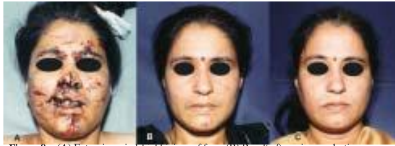
Figure 8: (A) Extensive windshield injury of face. (B) Result after primary plastic surgical repair. (C) Result after 4 IPL treatments (590 > lter) at monthly interval

Local anaesthetic cream is applied 1 hour before treatment to reduce pain and discomfort. The desired tissue response with Q-switched Lasers is immediate whitening of treated area and none or minimal pin point bleeding. It is best to use largest spot size with optimum power to prevent epidermal damage. Post treatment care consists of antibiotic cream with or without steroid for a few days, avoidance of sun exposure with use of sun block creams and bleaching creams at night to prevent laser induced hyper pigmentation. Multiple treatment sessions are preferred at 6 weeks or longer interval with