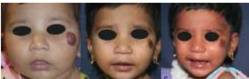
Figure 19: Hyper pigmentation following 5 Nd:YAG 1064 nm laser treatments for haemangioma. A single treatment with Q-Switched Nd:YAG overcame parental anxiety. Pigment clearing after 2 months