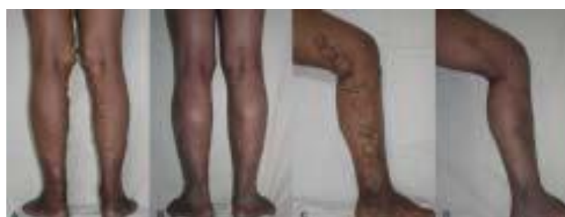
Figure 16: Varicose veins before and after EndoVenous Laser ablation with Diode 980 nm