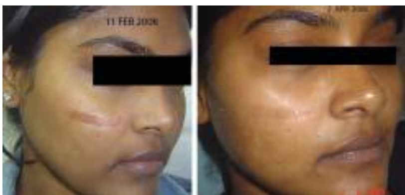
Figure 15: Spread and Atrophic ARSIL scar dramatically improved with Matisse TM (121) Fractional 1540 nm Erbium: glass laser non-ablative resurfacing

more, including reduction of wrinkles, levelling of deep scars and vaporisation of superficial skin lesions [Figure 14]. Unacceptable down time of this procedure led to the development of a promising non-ablative resurfacing techniques, which is now in the forefront.