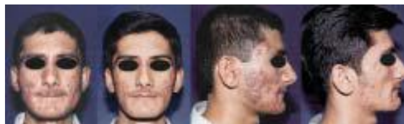
Figure 6: Severe pustular acne before and after 2 IPL treatments (590 > lter) as a part of multimodality managements