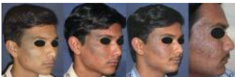
Figure 20: Severe and persisting mottled hypo-pigmentation after QS Nd:YAG 1064 nm 8 treatments for Nevus of Ota