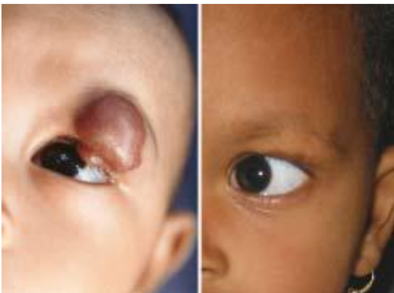
Figure 5: Haemangioma in a > ve month old baby in rapid proliferative phase before and 1 year after 5 treatments with Nd:YAG 1064 nm. Note undamaged eyebrow and eyelashes, example of chromophore specificity. Eye was protected by a special metal corneal shield. [11]