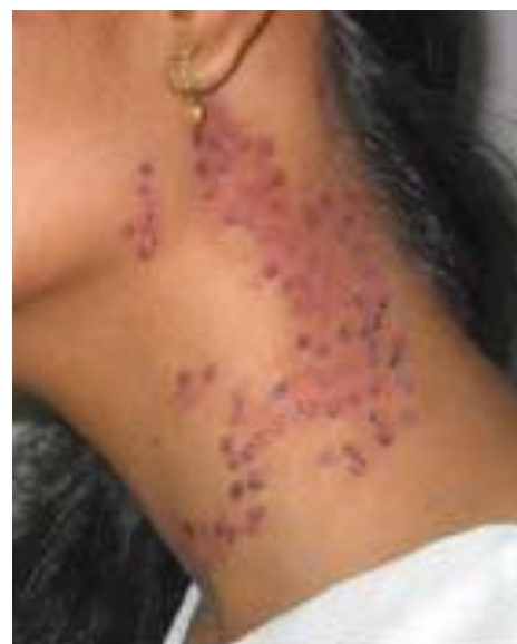
Figure 18: Purpuric spots after PDL 595 nm treatment of PWS. Usually they clear in a 5 to 7 days period