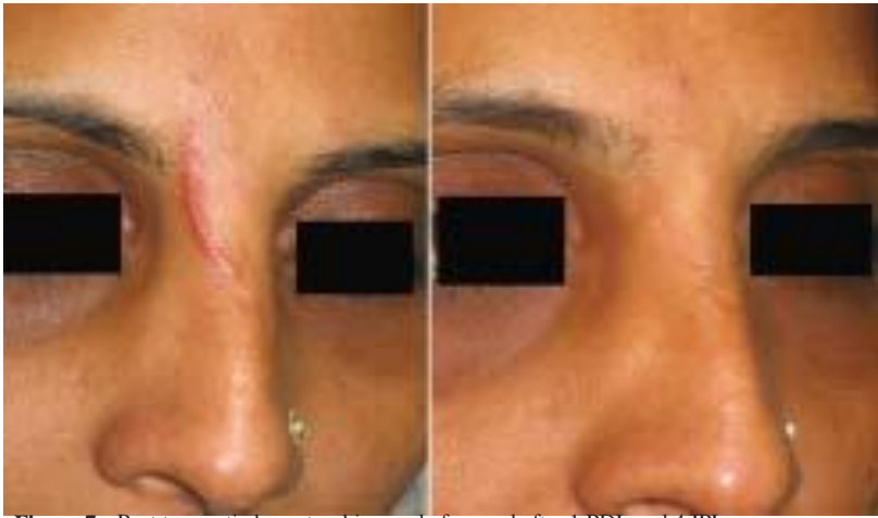
Figure 7: Post traumatic hypertrophic scar before and after 1 PDL and 4 IPL treatments (590 > lter.)